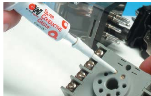
Step 3.2: Apply conductive grease to connectors