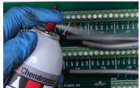
Step 1.2: Remove moisture with Flux-Off® Water Soluble cleaner and UltraJet® Duster

Cleaning will be necessary to remove oxidized oil, grease and other contamination. Most contacts and connectors contain sensitive plastics that will be destroyed using heavy degreasing products. For plastic-safe precision cleaning, remove the remaining contaminants with Electro-Wash® PX (part number ES1210), or for heavy-duty nonflammable degreasing use Electro-Wash® VZ (part number ES6100). Spray the equipment thoroughly or dip the equipment in the solvent and agitate while submerged. Allow the equipment and assemblies to drain and dry completely before returning the equipment to service. Make sure that all contaminated areas have been sprayed and completely cleaned.