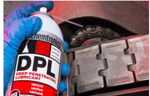
Step 3.1: Spray DPL lubricant on exposed metal to prevent oxidation

Chemtronics® provides a technical hotline to answer your technical and application related questions. The toll free number is: 1-800-TECH-401.