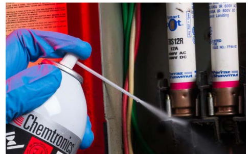
Step 2: Remove oil, grease and sludge with aerosol cleaner

Where removal of caked on grease, sludge and other contamination is required, and where there is little concern for plastic safety, Max-Kleen™ Tri-V™ (part number VVV2279) is used to remove debris and contamination. Spray the equipment thoroughly or dip the equipment in the solvent and agitate while submerged. Allow the equipment and assemblies to drain and dry completely before returning the equipment to service.