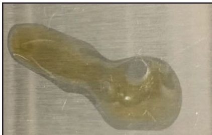
Rosin based flux on stainless steel test coupon