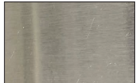
Test coupon after cleaning with Flux-Off No Clean Extra