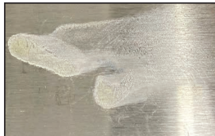
White residues left by competing flux remover