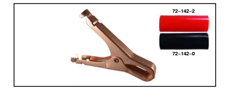
See page 14 for recommended insulators.